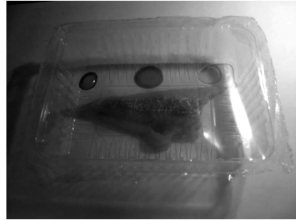
Figure 2. Freshness indicators containing grape peel extract (right side), methyl red (central position) or curcumin (left side) immobilised on PET/CPP foil (a) and inside the food packaging (OPS plastic box) (b)